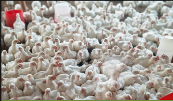
Pfunani Multipurpose Primary Cooperative - Page 21