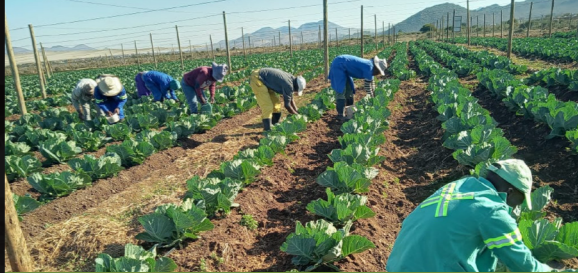
Ntsweletau Agricultural Cooperative - Page 19