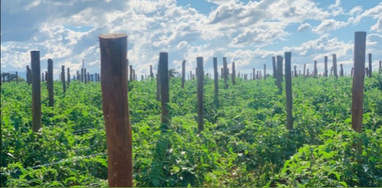
Maamahlale Agric Primary Cooperative Limited - Page 17